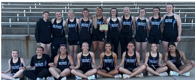
Congrats to our TCNE Wolfpack Girls Track & Field team on earning the HCC Trojan Invite Champion plaque in Hartington on April 15th.